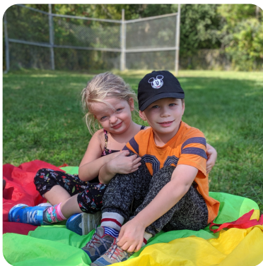
LRSS - CASE FOR SUPPORT

Our fundraising goal is to raise $50,000 annually